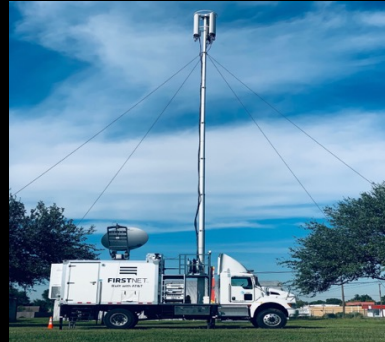
Texas City Fiber Cut