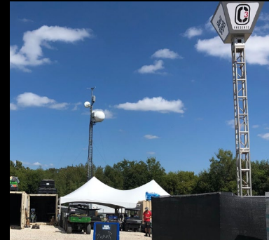
Austin – Austin City Limits Music Festival