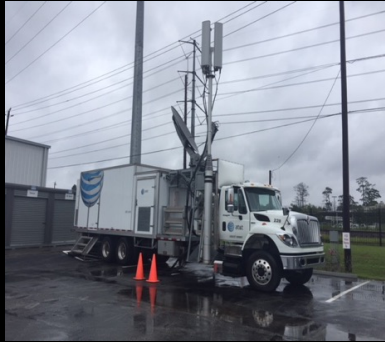
Harris County- Hurricane Harvey