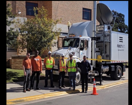
Austin – University of Texas Football Game