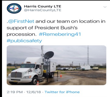
Harris County- George Bush 41 Funeral