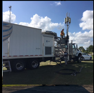
Chambers County- Air Freight Crash