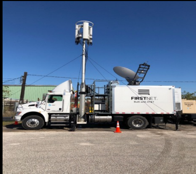
FEMA Region VI - Denton