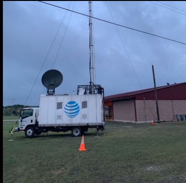
DPS Florence – Ride and Drive Event