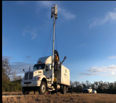
Robertson County- Search and Rescue