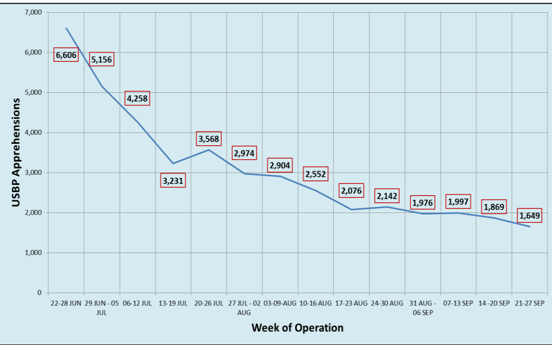
USBP Apprehension Trends in OSS Area of Responsibility (AOR) Zones*

*Numbers are constantly changing as dispositions are received.